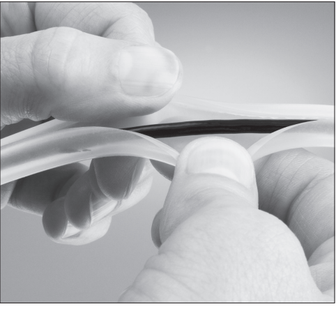
Pre-slit to install in minutes